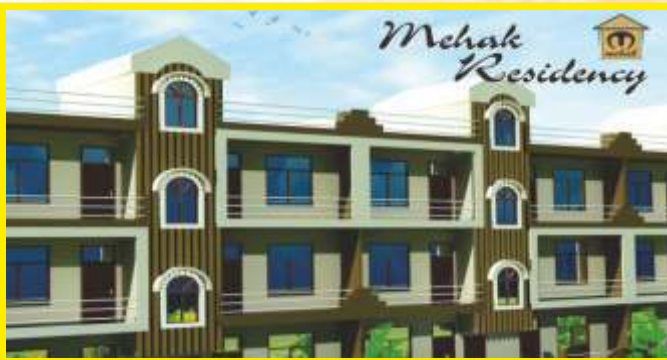
Mehak Residency Flats NH-91, G.T. Road, Ghaziabad (Delivered in year 2014)