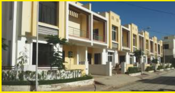
Mehak निर्माण Rudrapur, (Delivered in year 2011)