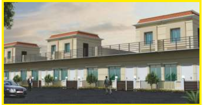
Mehak Eco City (80 Sq.yd. Villas) NH-91, G.T. Road, Ghaziabad (Delivered in year 2017)