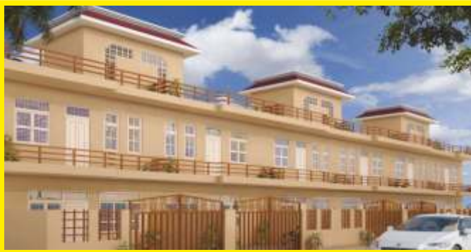
Mehak Eco City (100 Sq. Yd. Villas) NH-91, G.T. Road, Ghaziabad (Delivered in year 2017)