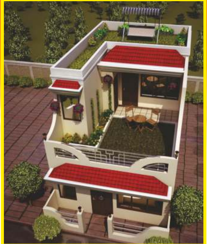
Mehak Residency Villas NH-91, G.T. Road, Ghaziabad (Delivered in year 2014)