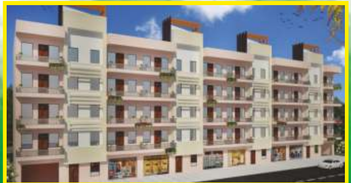
Mehak Eco City (Independent Floors) NH-91, G.T. Road, Ghaziabad (Delivered in year 2017)