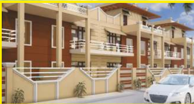
Mehak Eco City (120 Sq. Yd. Villas) NH-91, G.T. Road, Ghaziabad (Delivered in year 2017)